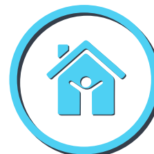
Independent Living Skills