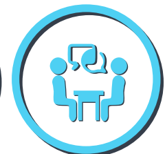
Mental Health Services