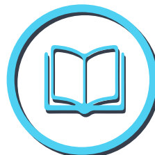
School and Other Education