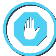
Gang Prevention Programs