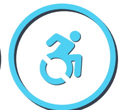
Special Needs Services