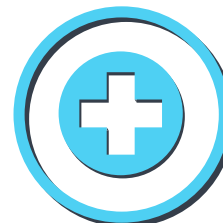
Medical and Dental Services